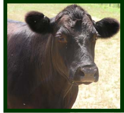
Black Angus Bingo Star, "Babs"

Find out who won $500...with a little help from this cow.