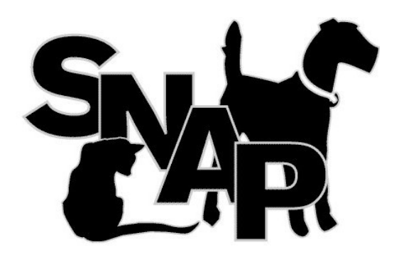
Spay Neuter Assistance Program, Inc.

NONPROFIT ORG. US POSTAGE PAID SPRINGFIELD, MO