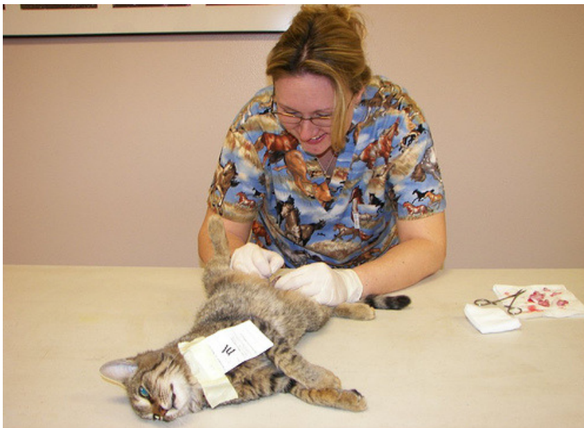
“Vet Tech” by Feral Indeed! on flickr.com.

M andatory spay and neuter laws are once again in the news as both the city of New Orleans and the state of California consider passing one. The idea behind mandatory spay/neuter laws is intuitively appealing: since spay/neuter has proven effective for reducing the euthanasia of dogs and